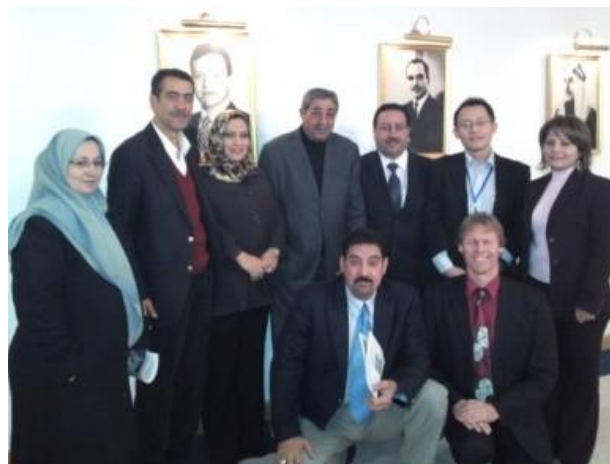
PNND meets in the Jordan parliament with senators and deputies including the heads of the Health and Energy Committees.